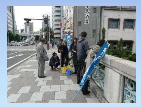
Research by Nakanihon Engineering Consultants Co., Ltd