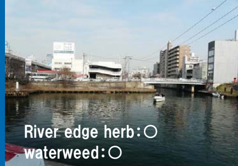
Near the Matsuehimon sluice