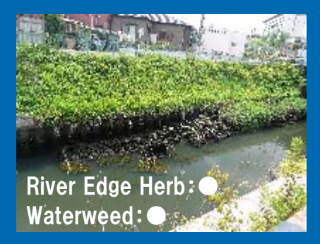
Upstream of Sujikai-Bridge